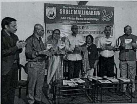
1: Book Release in Goa Lit Fest 22-23

Supporting agency: SHREE MALLIKARJUN and Shri C. M. D. College, Canacona INNSAEI Journal A.C.C. Kasegaon