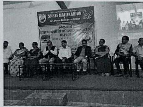
2: Inauguration Function Goa Lit Fest 22-23